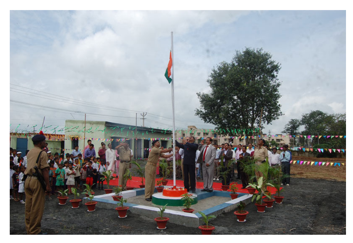
Hon'bleMr. Justice N.N.Tiwari hoisting a National Flag on the Independence Day.

Chairperson Hoisted the National Flag on 15^{\rm th} August 2014 in the proposed building premises of JSERC .