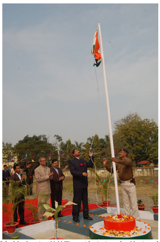
Hon'ble Mr. Justice N.N.Tiwari hoisting the National Flag.

Commission celebrated Republic Day on 26^{th} January 2015 in its proposed building premises. National Flag was hoisted by Hon'ble Mr. Justice N.N.Tiwari. All Officers, Staff and there family participated on this festive celebration.