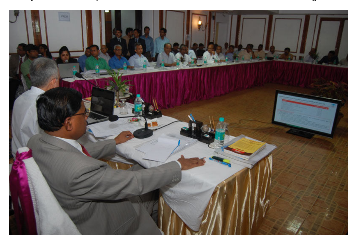
A SAC meeting in progress.