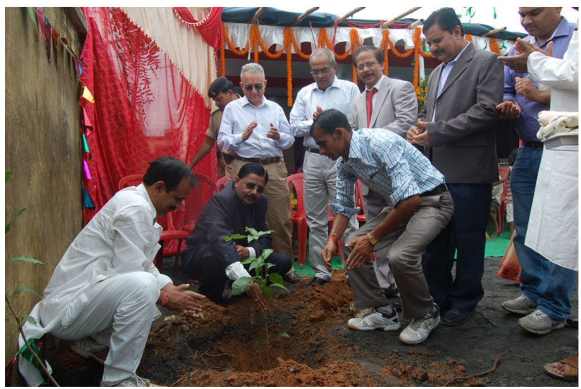
Plantation by - Hon'bleMr. Justice N.N.Tiwari, Chairperson JSERC

Eco-Development and Conservation Programme More than hundred trees are planted in the proposed building premises of the JSERC by the Hon'ble Chairperson, Members, Ombudsman and Staff of the Commission.